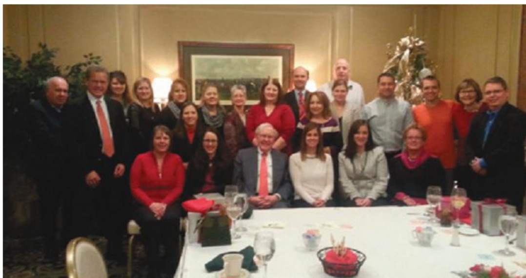
A power lunch, Berkshire-style

最后，我觉得应该无视我们年报“无图片”的传统，让大家看看我们举世瞩目的办公室团队。下面是我们圣诞节晚餐的一张照片。有两个人缺席；不然你就可以看到伯克希尔总部的全家福了。他们真的是创造奇迹的员工。